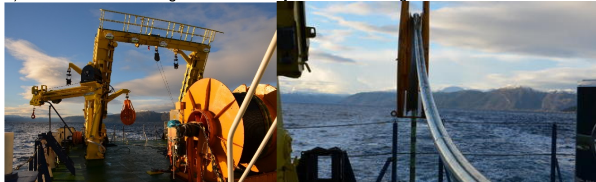
left: winch containing the towed array, right: towed array longing from the winch over the reel into the water

b) a winch for unwinding the towed array and transferring it into the water