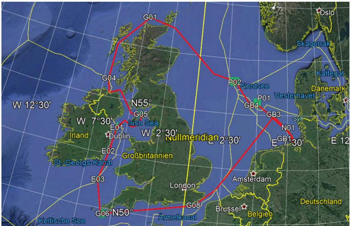
Fig. 1: Cruise 432 RV 'Walther Herwig III', 2.12. – 20.12.2019: Location of sampling sites in the North Sea and Irish Sea