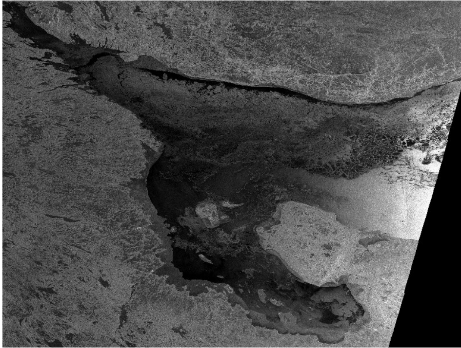
Figure 2 – Satellite image of ice conditions on 12 March 2016