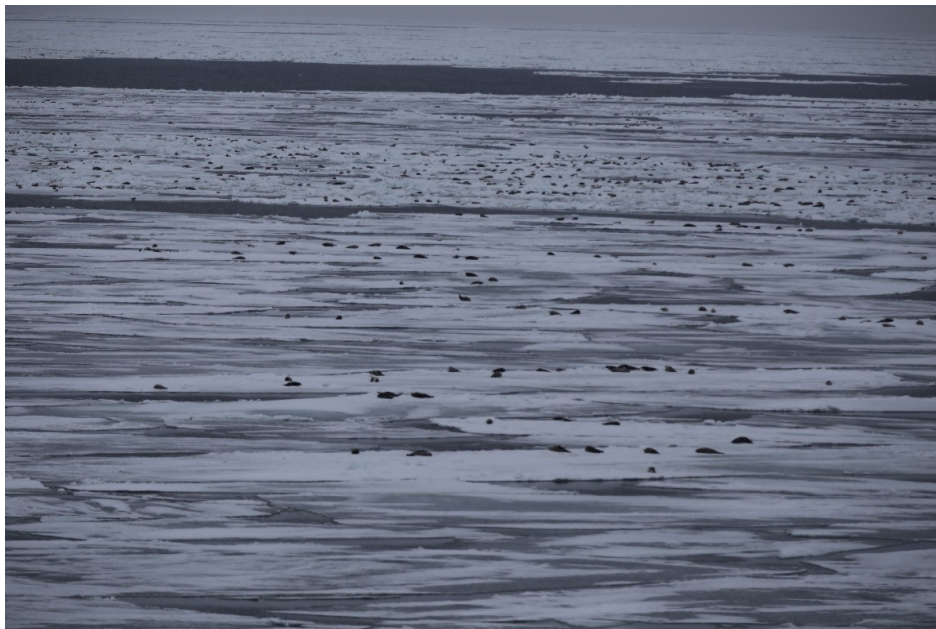
Figure 3 – Distribution of Barents Sea/White Sea harp seals (of all ages) during moult in the south eastern part of the Barents Sea (mean position 69.75°N/57.50°E) on 16 April 2016 (photo from oil platform “Prirazlomnoe”)