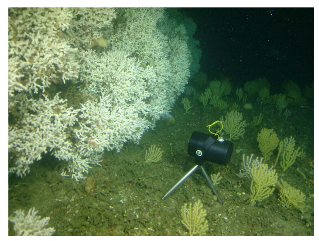
Figure 2 Underwater video camera system (version 2.0) placed in front of a whole L. pertusa colony. Nordleksa reef.

To further investigate the retraction/extension behaviour of cold-water coral Lophelia pertusa in their natural habitat, an advanced version of the autonomous video setup from the 2013 cruise (cf. POS455 cruise report) was deployed in front of a living coral colony with the submersible JAGO.